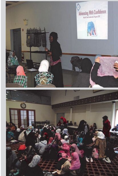
Top: workshop at Islamic Society of Lehigh Valley Bottom: workshop at Islamic Society of Delaware