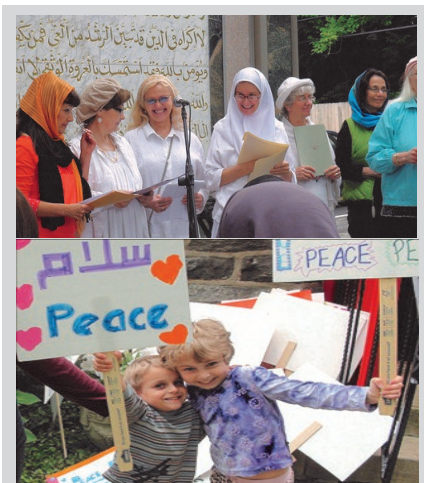
Interfaith Peace Walk