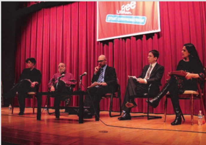
CAIR-Philadelphia event at the Free Library of Philadelphia in February aimed to educate the public on Sharia and how it is understood in American Society.