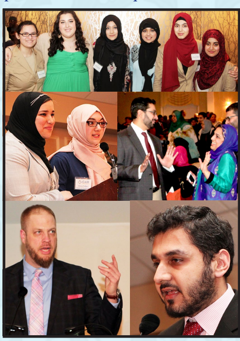
Scenes from the Banquet.

Nearly 700 supporters and friends of CAIR-Philadelphia gathered in the elegant ballroom of the Springfield Country Club on March 7th for CAIR-Philadelphia's 9th Annual Banquet.