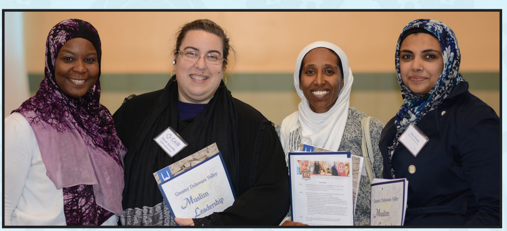
Participants in a recent meeting of the Greater Delaware Muslim Leadership Forum.

If you are a community leader and wish to join future meetings, please contact us.