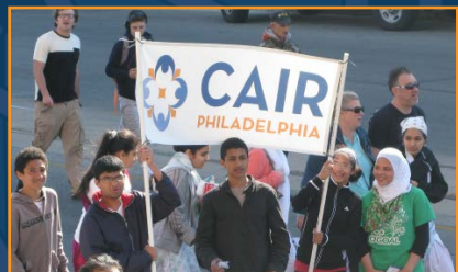
CAIR-Philadelphia youth participating in the annual "Philadelphia Interfaith Peacewalk."