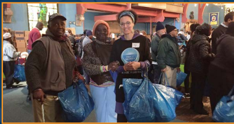
CAIR participated in Islamic Relief's "Day of Dignity" to donate food and clothing to low-income and poor people in Philadelphia.