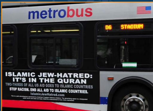
CAIR-Philadelphia joined a city-wide interfaith coalition to respond to the bigoted anti-Muslim ads, such as the one to the left, that have appeared in other cities, and that have been paid for by Islamophobic activists for placement on SEPTA buses.