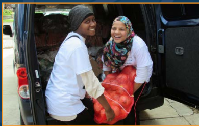
Collecting food for the city's homeless shelters during CAIR-Philadelphia's Ramadan Food Drive.