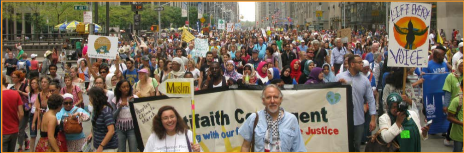
CAIR-Philadelphia joined with other Muslim organizations to organize the Muslim contingent at the People's Climate March in New York City on Sept. 21.