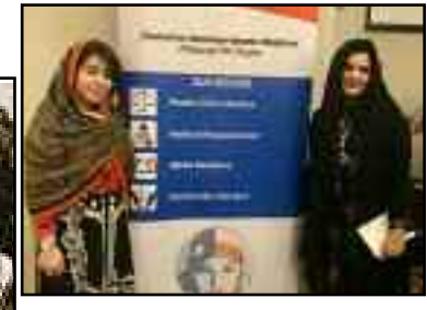
Held at MAP mosque